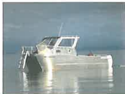
PWS vessel Mavadenna

Freycinet Peninsula is only accessible by boat. Parks and Wildlife Service provide transport to and from the peninsula from Coles Bay, on board the PWS vessel. The trip takes approximately 20 minutes.