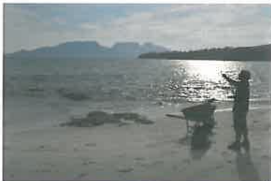
Volunteer's Sunset on Cook's Beach

All persons volunteering with Parks and Wildlife Service are required to conduct their duties in accordance with the State Service Principles and Code of Conduct. Unsatisfactory performance or behaviour is not acceptable and may result in termination of the volunteer arrangement.