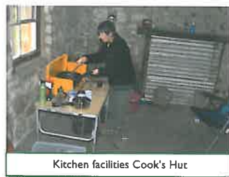
Kitchen facilities Cook's Hut

A full listing of equipment is supplied to successful applicants for planning purposes prior to their placement. Volunteer Track Wardens will need to bring with them