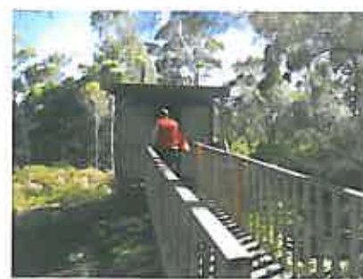
Composting toilet Cook's Beach

Water is available from the Cook's Hut tanks and a refillable kitchen water container is provided. Fresh (tank) water should be treated prior to consumption with either water purifying tablets or boiling and be used sparingly. Kitchen equipment (pots, pans, plates, crockery) and washing up equipment are provided.