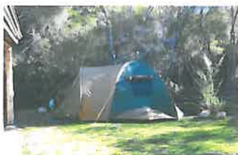
Your tent home on Freycinet Peninsula

The night before each scheduled embarkation Volunteer Track Wardens will stay in Parks and Wildlife Service shared accommodation at Freycinet Field Centre, Coles Bay.