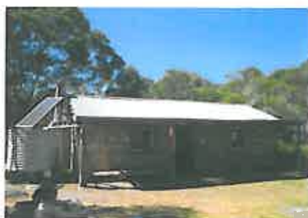
Cook's Hut solar panel & water tank

A gas/electric powered cooler and eski are available for food storage at the base camp. Facilities also include a gas cooker.